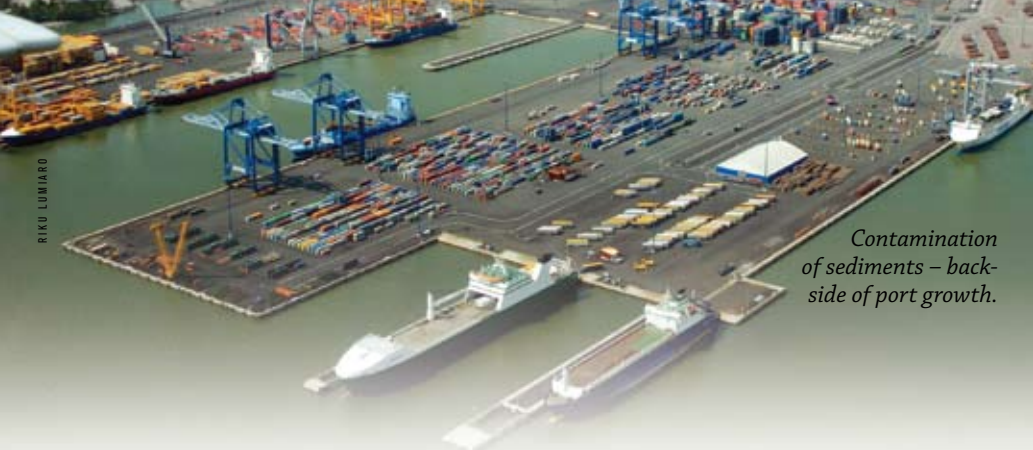
Contamination of sediments – back-side of port growth.